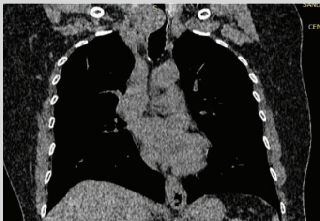
Figure 2: An incidental finding at the level of the neck is visualized as an image of soft tissues, which extends to the mediastinum, findings suggestive of goiter versus thyroid carcinoma. esophageal neoplastic is not ruled out.