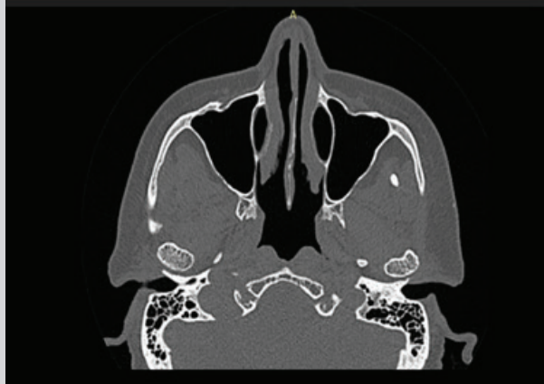
Figure 1: Paranasal sinus tomography: right mucoperiosteal thickening is seen, as well as nasal septum deviated to the left.

presenting a new picture of hemoptysis without improvement to outpatient treatment. An appointment with otorhinolaryngology and a paranasal sinus tomography was scheduled, which was evidenced (Figure 1). Otorhinolaryngology indicated outpatient management with rupax, steroids + antihistamines in nasal spray and nasal washes, in addition to referral for consultation with pulmonology and performance of a chest computed tomography, which was evidenced (Figure 2).